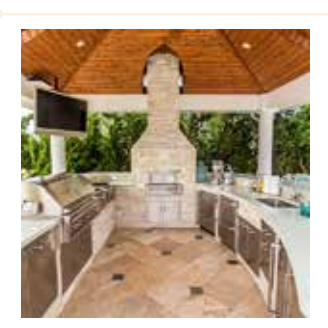
Stainless Steel Outdoor Kitchen