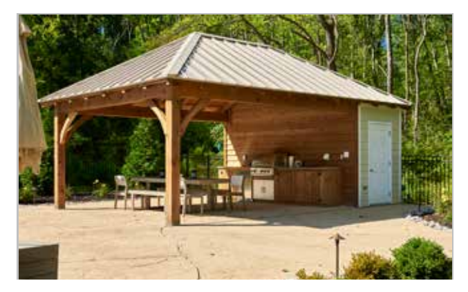
Timber Frame Avalon Pool House / 16' x 24'

Options Shown: Banyan Brown Stain, Harvard Slate Shingles, Hip Roof with Reverse A-Frame Open Gable, Cedar Siding under Pavilion, Stone Piers, 30" Carlisle Copper Top Cupola, Electrical Package