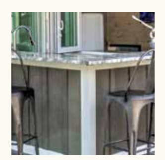
Hardie B&B Siding