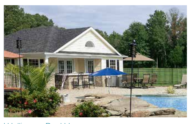
Wellington Pool House / 24' x 36' Cream Vinyl Siding, White Trim, Dual Black Shingles Options Shown: Bar with Tile Countertop, Extra Window, Garage Area, ½ Round Window in Reverse