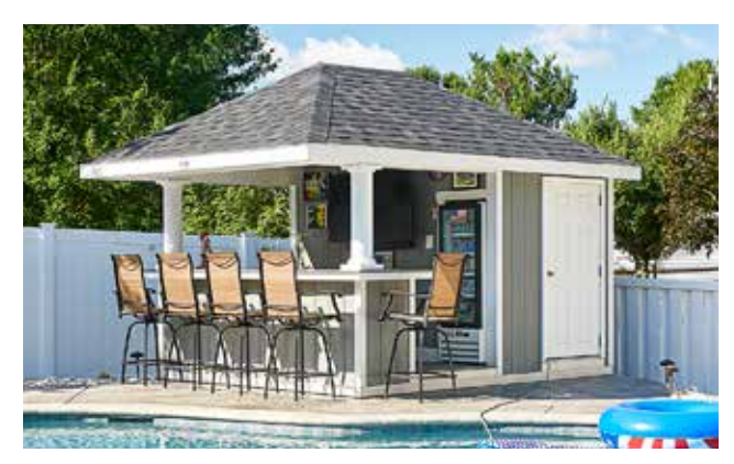
Siesta Poolside Bar / 10' x 12'

Options Shown: Smart Panel Siding on Back Wall & Ceiling, 8' Square Vinyl Columns, Stone Veneer on Bar Front, Granite Countertop, Bar Sink, Spot for Fridge & Kegerator, Pine T&G Interior Walls & Ceiling, Linoleum Flooring, Gutters (White), Electrical Package, Fan/Light Combo, Soffit Lights, 12' x 12' Attached Vinyl Pergola