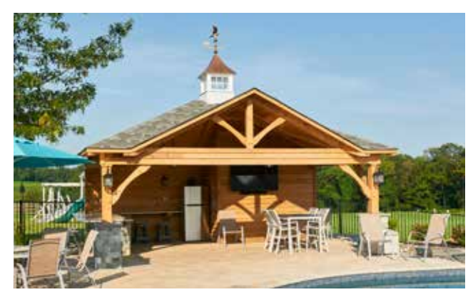
Timber Frame Avalon Pool House / 18' x 22'

Options Shown: Mushroom Stain, Monterey Sand Vinyl Clapboard Siding, Harvard Slate Shingles, A-Frame Roof, Custom 2-Tiered Bar Counter with Appliance Cutouts, Bluestone Countertop, Stone Piers, Electrical Package