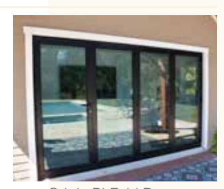
Origin Bi-Fold Doors (Black or White) Origin French Doors Available