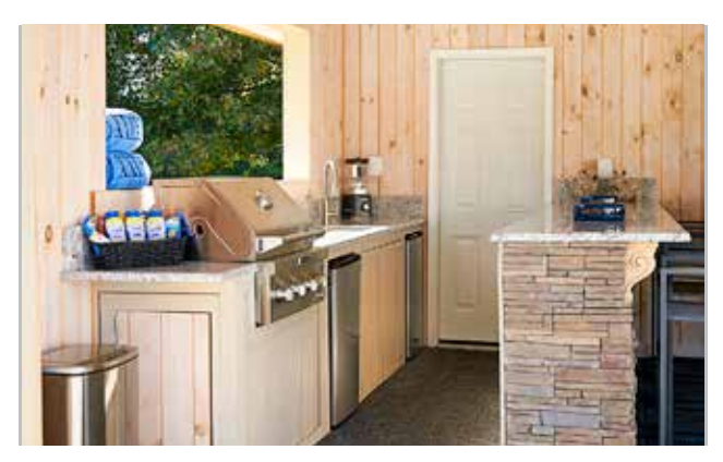
Outdoor Kitchen Details