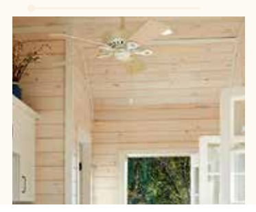
Pine T&G Interior (Stained-White Wash)