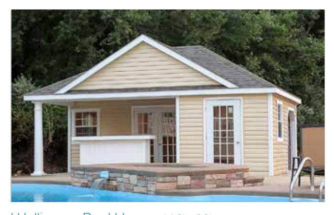
Wellington Pool House / 16' x 22' Ivory Vinyl Siding, White Trim, Weatherwood Shingles Options Shown: Extra Overhead Door, Bar with Tile Countertop, Azek Beadboard Bar Front