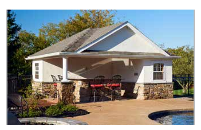
Wellington Pool House / 16' x 20' Stucco Siding, White Trim, Upgraded Shingles Options Shown: Bar with Granite Countertop, Stone Veneer, Stone Pier