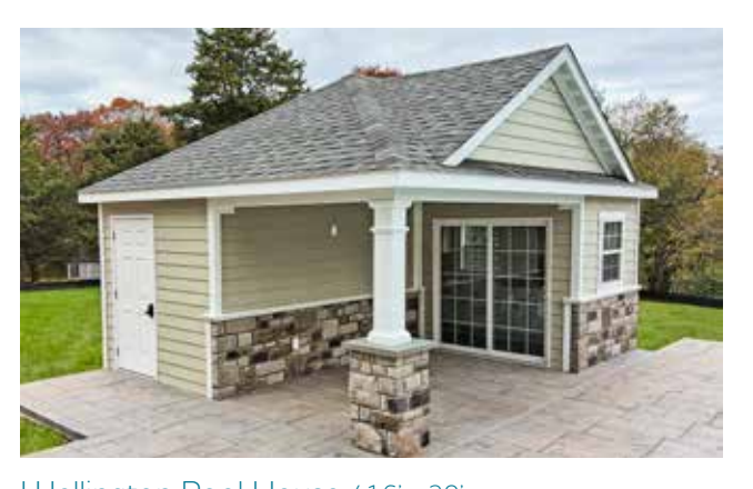
Wellington Pool House / 16' x 20' Silver Maple Hardie Plank Siding, White Trim, Charcoal Gray Shingles Options Shown: Stone Veneer (Pennsylvania), Stone Pier for Column, ecoLite Patio Door, Fully Finished Interior, Electrical Package