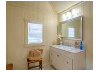
LP Smart Panel Interior