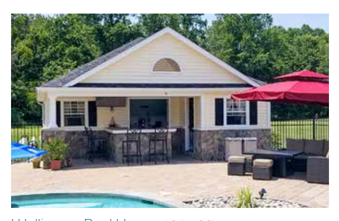
Wellington Pool House / 24' x 36' Cream Vinyl Siding, White Trim, Dual Black Shingles Options Shown: Bar with Tile Countertop, Extra Window, Garage Area, ½ Round Window in Reverse