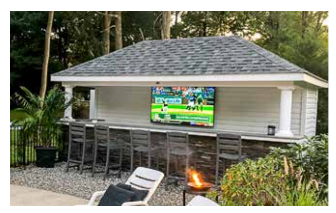
Siesta Poolside Bar / 10' x 18'

Options Shown: Stone Veneer on Bar & Back Wall, Tile Countertop, TV, Electrical Package, Light/Fan Combo