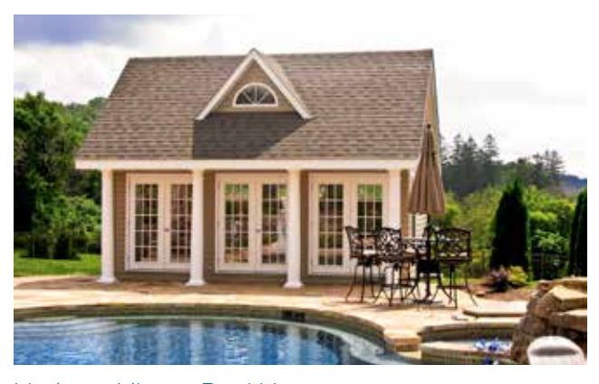
Heritage Liberty Pool House / 17' x 20'

Sand Vinyl Siding, Clay Trim, Driftwood Architectural Shingles Options Shown: Clay Doors, Extra 15-Lite Double Door, Vinyl Shake Siding, 7' Windsor Dormer with 1/2 Round Window