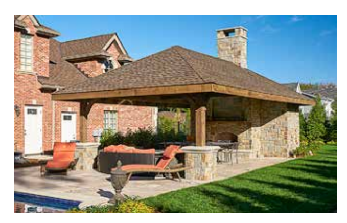
Timber Frame Pool House / 16' x 32'

Options Shown: Hip Roof, Stone Piers, Fireplace, Enclosed Room with Stone Veneer Exterior