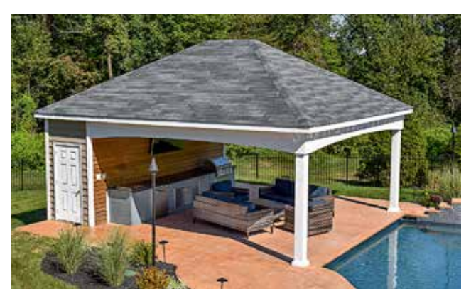
Avalon Hip / 20' x 25'

Clay Vinyl Siding, White Trim, Special Shingles Options Shown: 8" Square Vinyl Columns, 16' Bar with Cabinets & Grill Cutout, Electrical Package