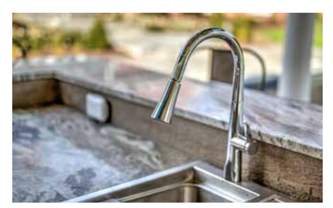
Outdoor Kitchen Details