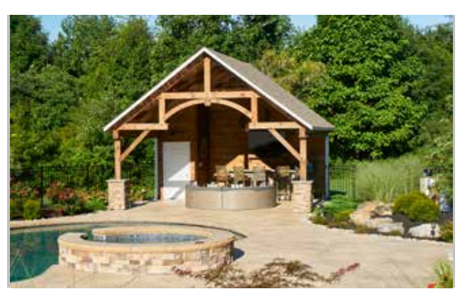
Timber Frame Avalon Pool House / 20' x 20'

Options Shown: Hip Roof, Stone Piers, Fireplace, Enclosed Room with Stone Veneer Exterior