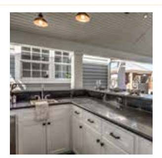
Everlast HDPE Cabinets