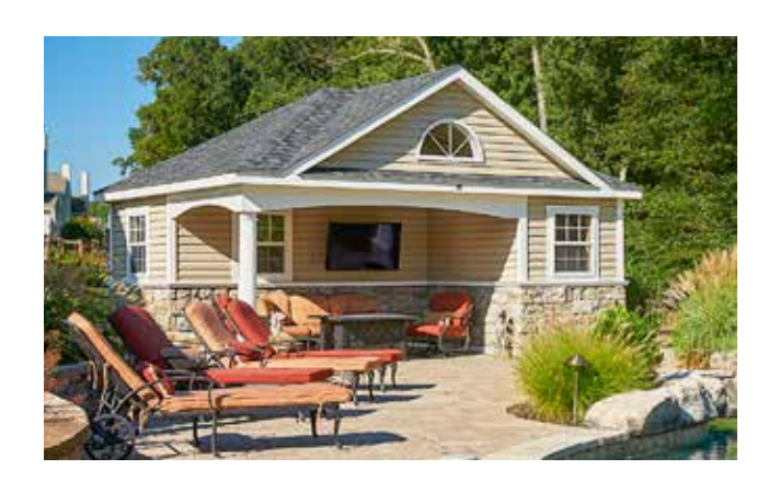
Wellington Pool House / 16' x 24' Vintage Wicker Vinyl Siding, White Trim, Dual Black Shingles Options Shown: Stone Veneer, ½ Round Window in Reverse, 12" Higher Walls, Arched Beam Trim