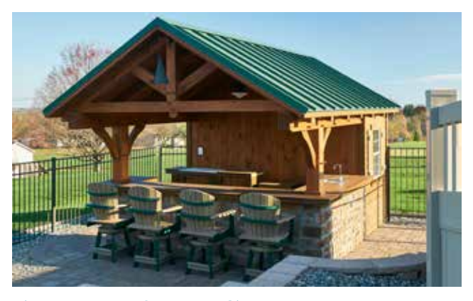
Timber Frame A-Frame Siesta / 12' x 14'

Options Shown: Mushroom Stain, Navajo Beige Special Siding, Clay Standing Seam Metal Roof, Custom Bar Counter with Cabinets and Appliance Cutouts, Finished Bathroom, Electrical Package