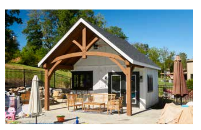
Timber Frame Avalon Pool House / 16' x 22'

Options Shown: Mushroom LP Lap Siding, Bark Mulch Trim, Green Standing Seam Metal Roof, 2' Extra Bar Area, Custom Bar Counter on Back Wall of Bar, Bar Cabinets & Sink, Electrical Package, Light & Fan Combo