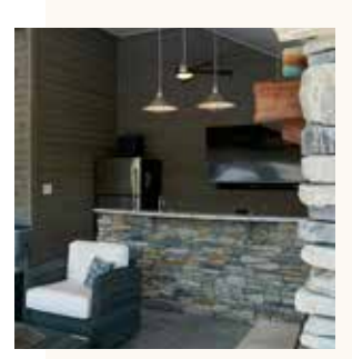
Stone Veneer Bar (Different Colors & Textures Available)