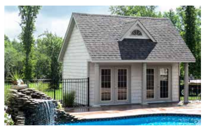
Heritage Liberty Pool House / 15' x 18'

Sand Vinyl Siding, Clay Trim, Driftwood Architectural Shingles Options Shown: Clay Doors, Extra 15-Lite Double Door, Vinyl Shake Siding, 7' Windsor Dormer with 1/2 Round Window