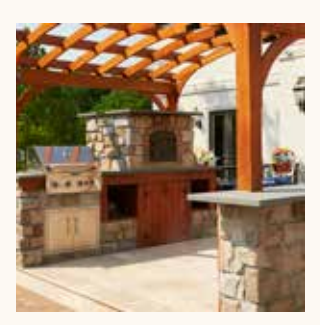
Outdoor Kitchen with Pergola