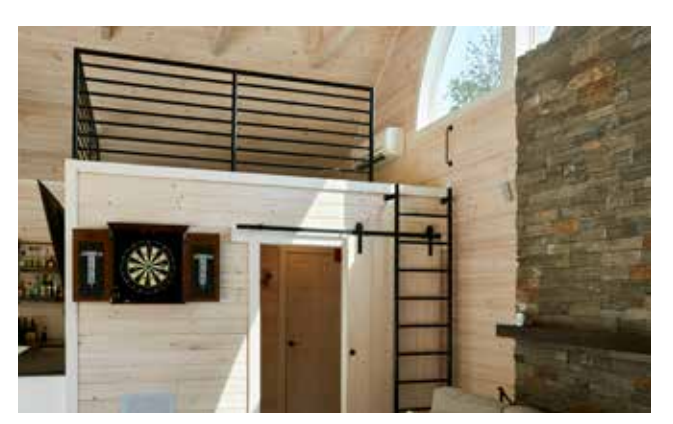
Changing Room Details